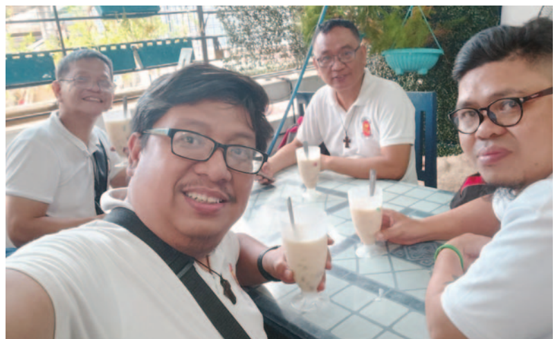
And after tree planting – ice cream!