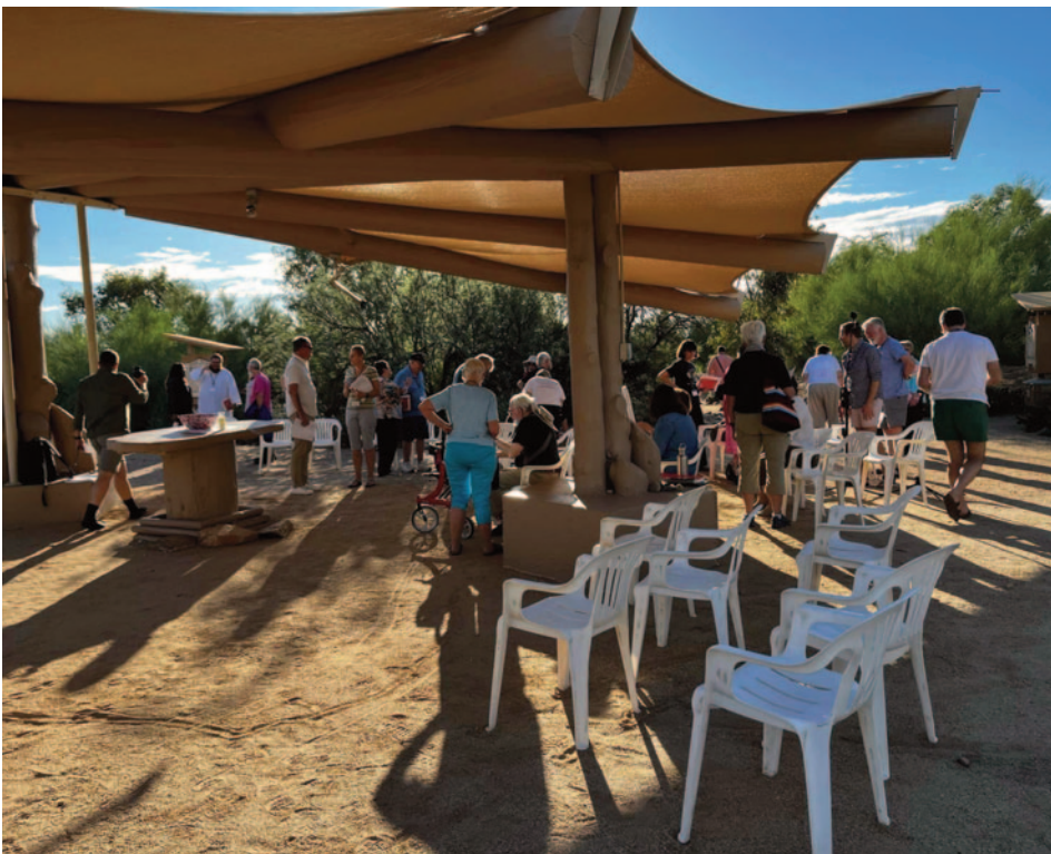
Morning Prayer was held daily at the outdoor chapel at Franciscan Retreat Center. Even when the sounds of the world intruded on worship, a sense of the sacred was still present.