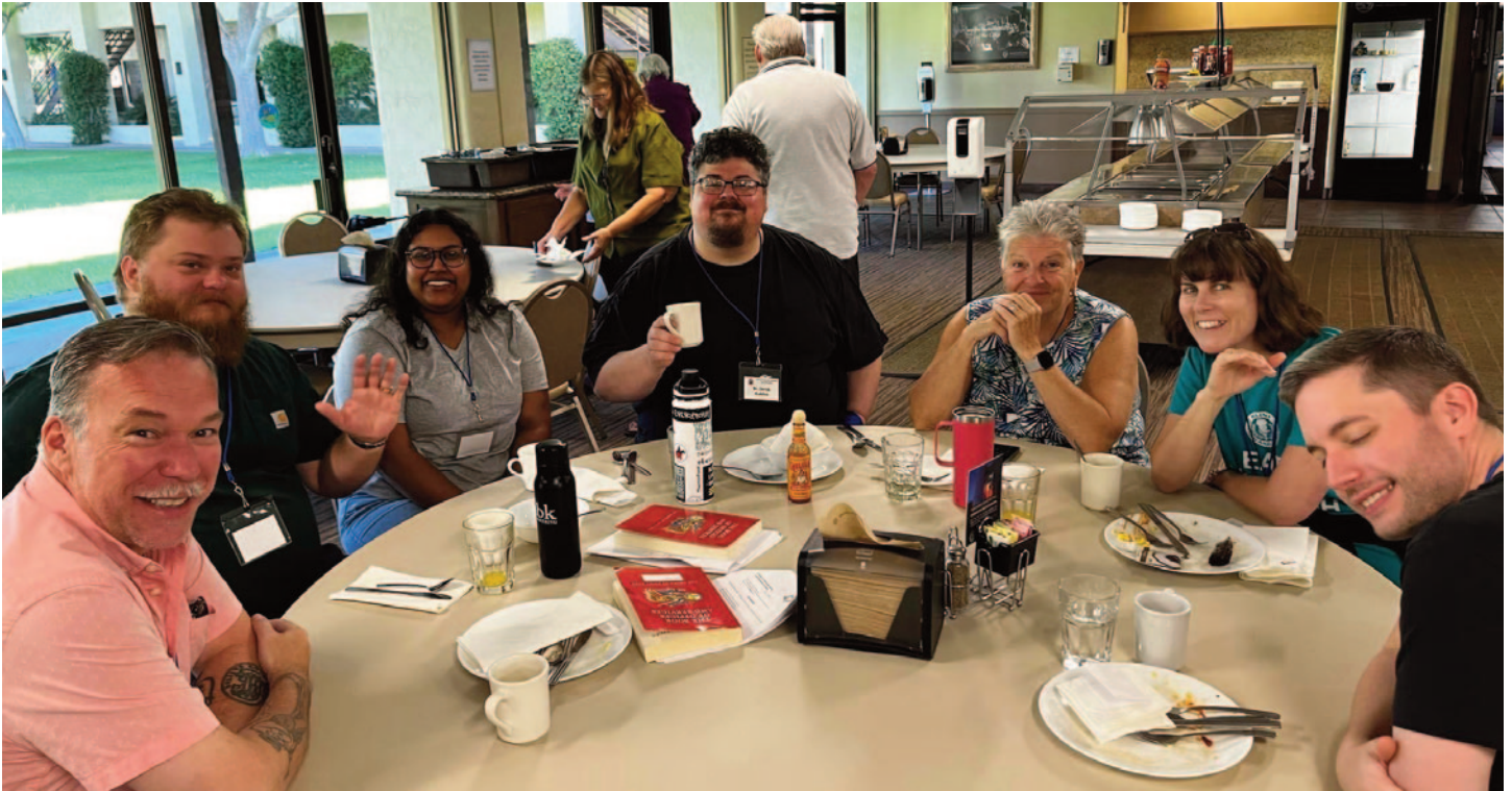
Wherever there's food, there are Lukans. How many of these siblings can you name?