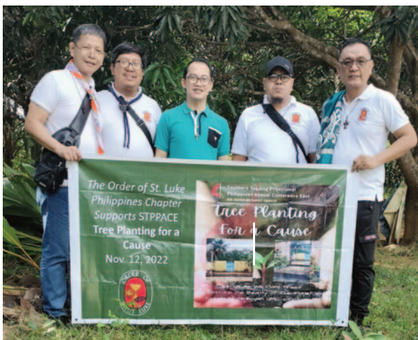
Sharing OSL support for the tree planting project with a banner.